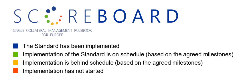
Table 1 Compliance level with the standards by each entity type