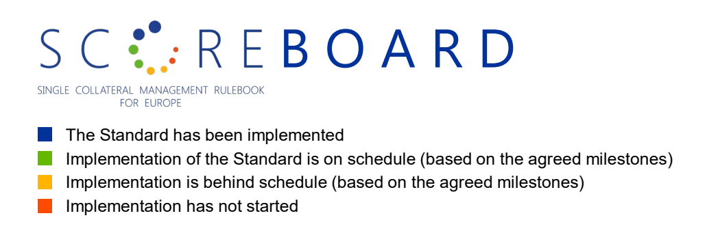
Table 1 Compliance level with the standards by each entity type